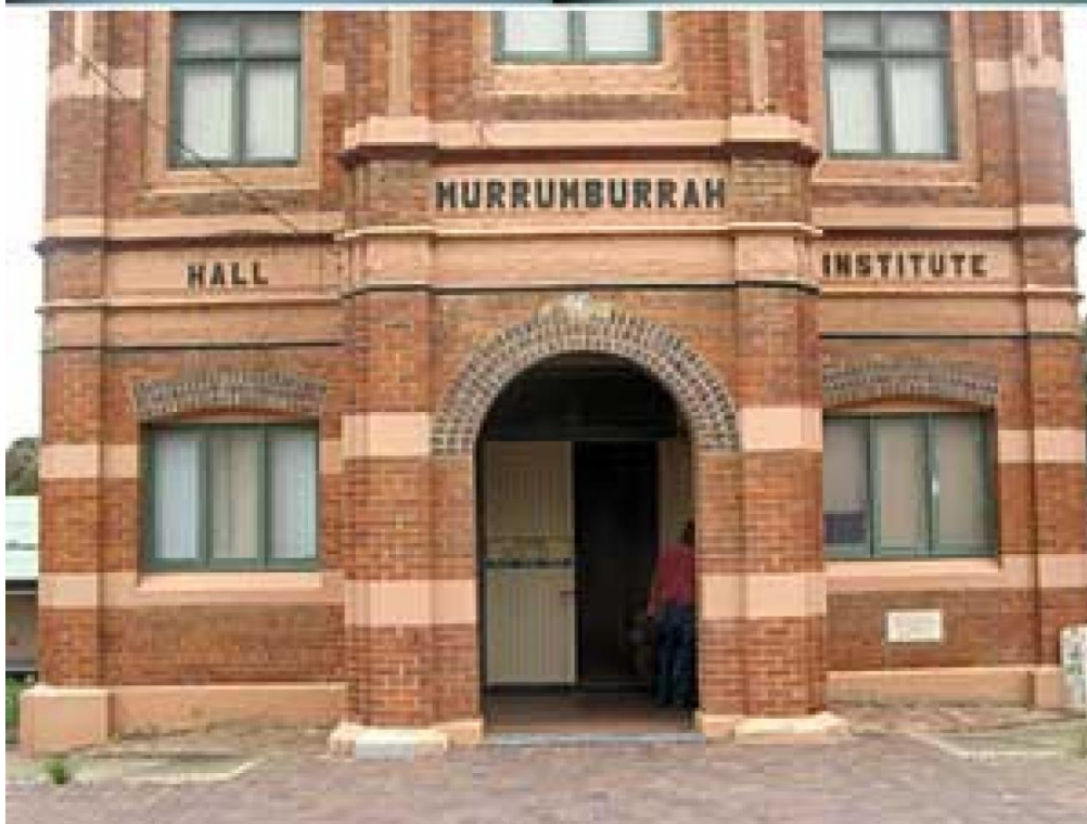
Murrumburrah Mechanics Institute Hall World War 1 Roll of Honour