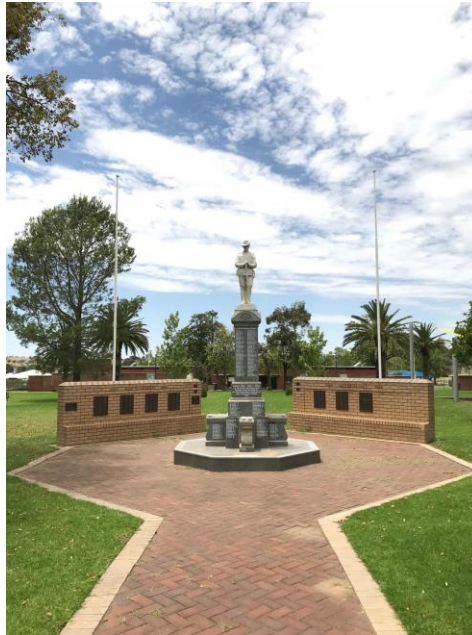
Harden War Memorial