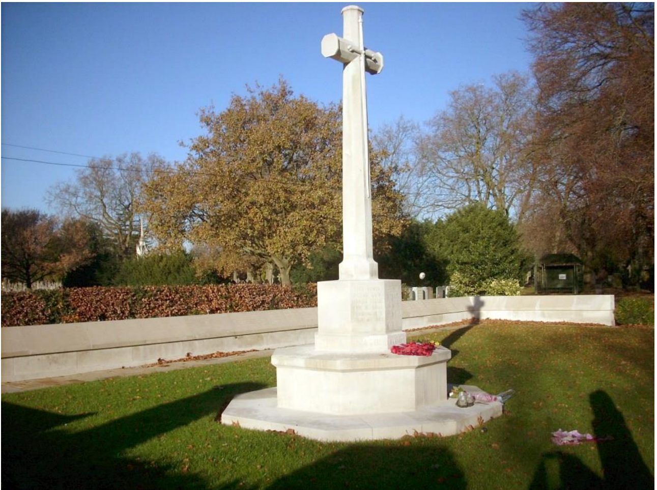
Cross of Sacrifice